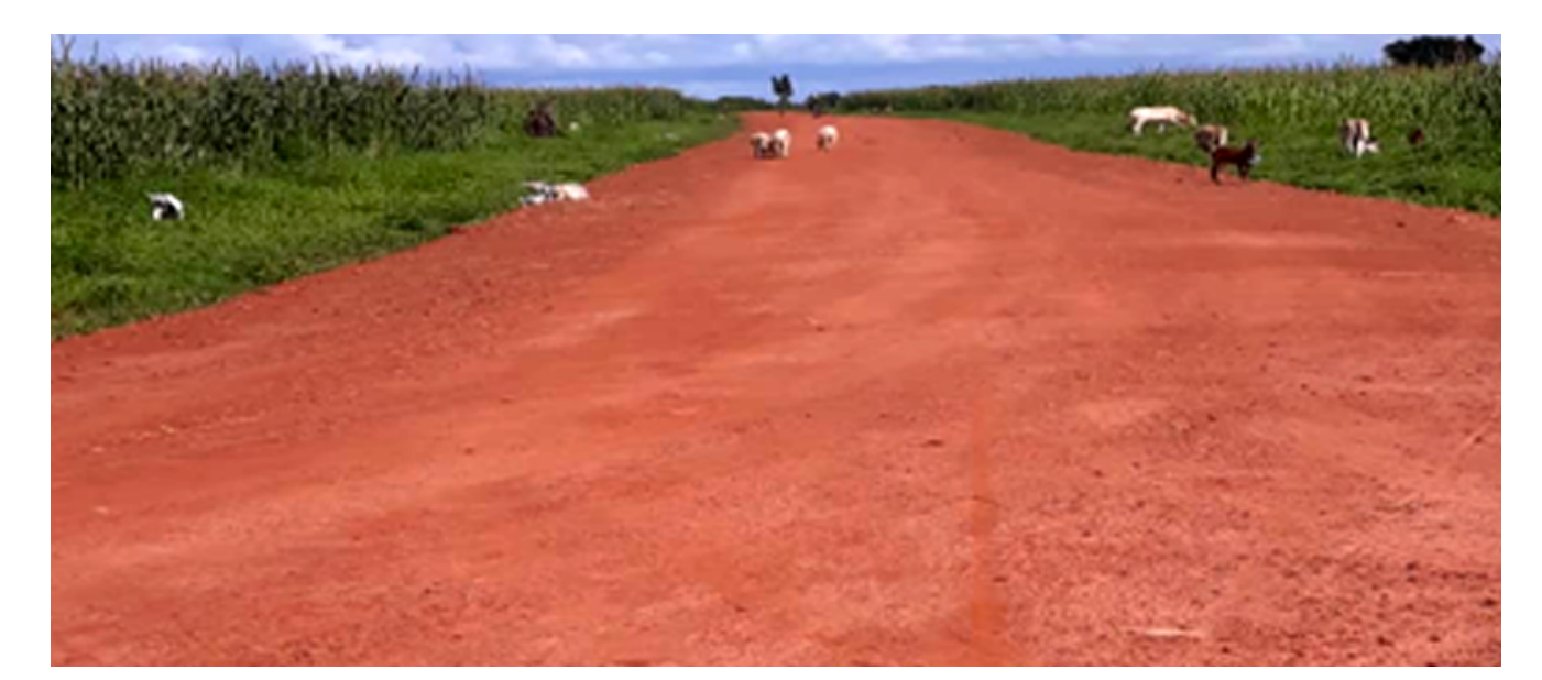
As noted by Awa Jagne, a leading woman farmer of Boiram:

The case of the Boiram, Fass and Njoben inter-village road is a good illustration of how the farm-to-market access initiative of the project is contributing to sustainable agricultural value chain development and supporting access to vital social services in rural areas of The Gambia. The access road links the communities of Boiram, Brikama ba, Njoben, Fass and Tabanding in the Central River Region/South