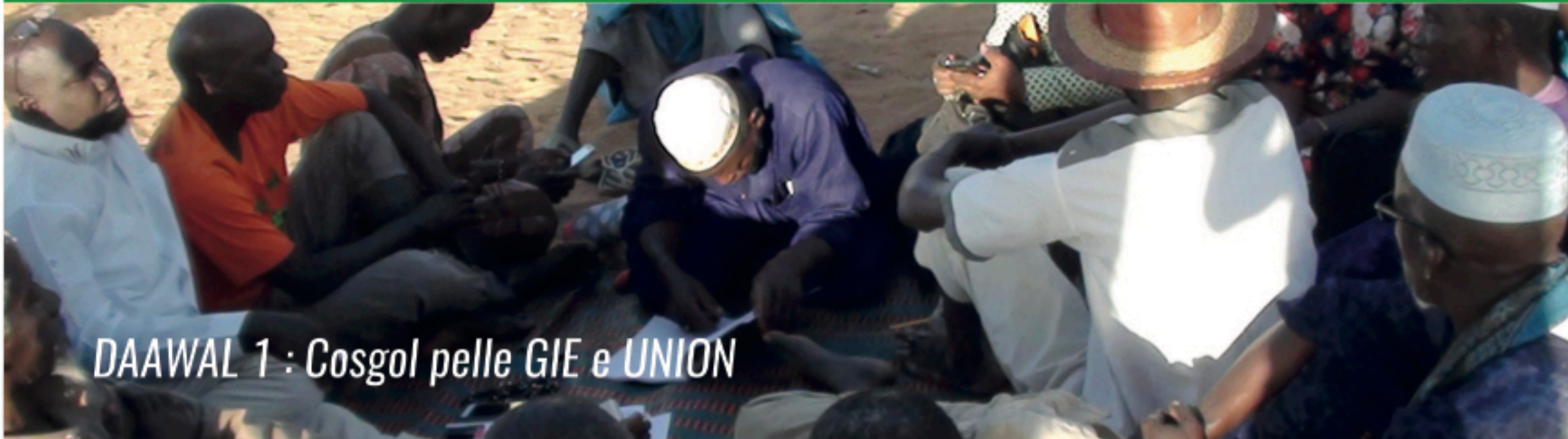
DAAWAL 1 : Cosgol pelle GIE e UNION