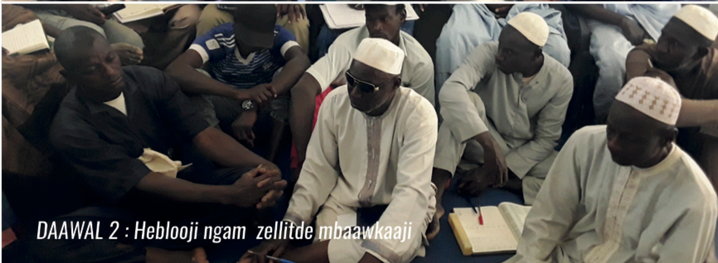
DAAWAL 2 : Heblooji ngam zellitde mbaawkaaji